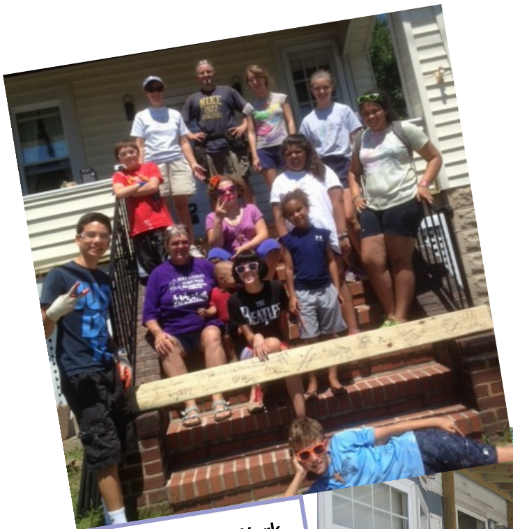
Baltimore County Work Camp Crew