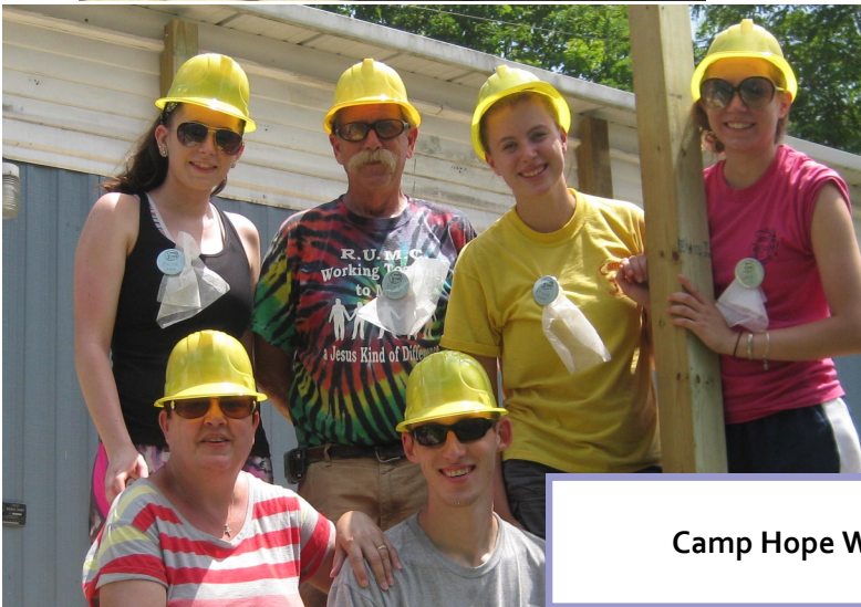
Camp Hope Work Crew